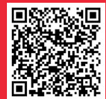
COMPLETE PACKING LIST