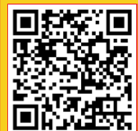
CAMP APPAREL STORE