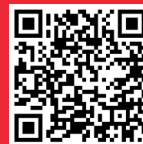
DELEGATES INFORMATION PAGE ON WEBSITE

(Additional camp shirts can be pre-purchased at Boys State Apparel Store)